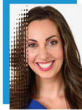
Vanessa Van Edwards